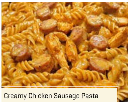
Creamy Chicken Sausage Pasta