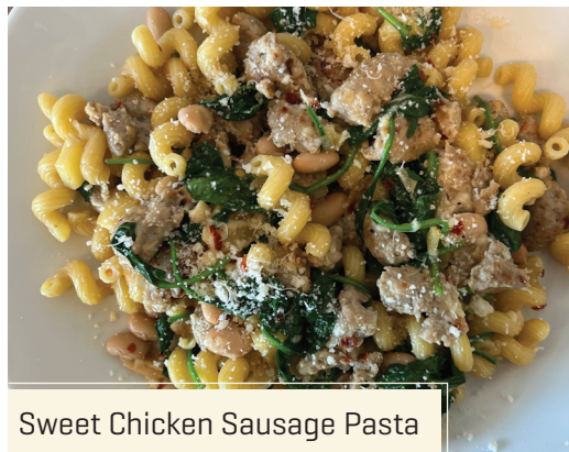
Sweet Chicken Sausage Pasta