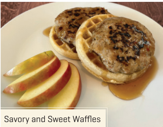
Savory and Sweet Waffles