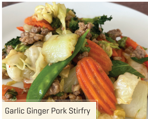
Garlic Ginger Pork Stirfry