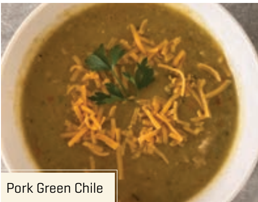
Pork Green Chile