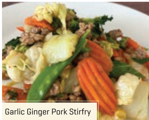
Garlic Ginger Pork Stirfry