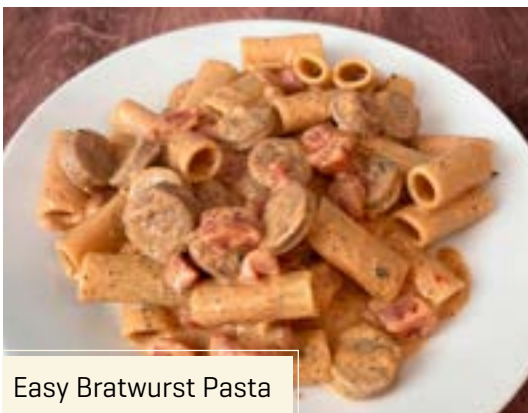
Easy Bratwurst Pasta