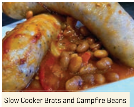
Slow Cooker Brats and Campfire Beans