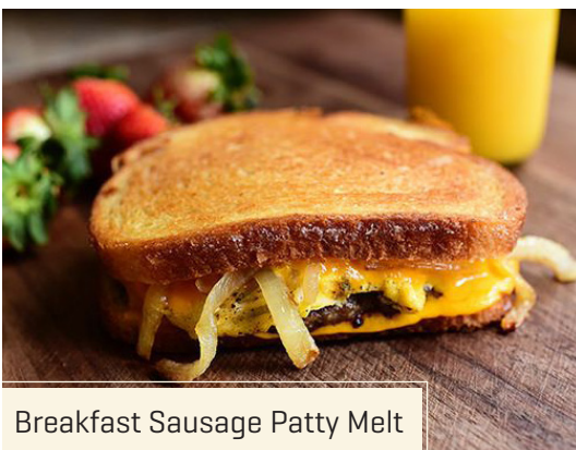
Breakfast Sausage Patty Melt