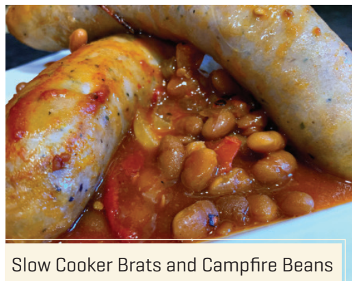
Slow Cooker Brats and Campfire Beans