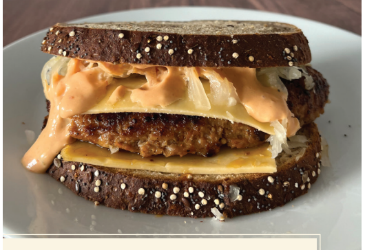
Grilled Reuben with Polish Sausage