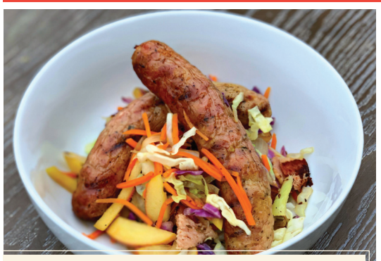
Polidori Beer Brats and Braised Cabbage