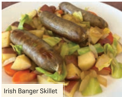
Irish Banger Skillet