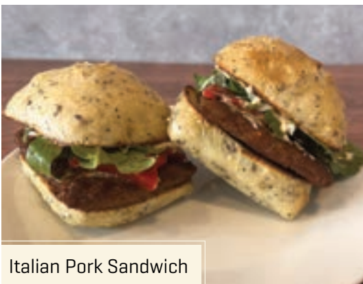
Italian Pork Sandwich