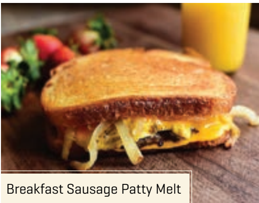
Breakfast Sausage Patty Melt