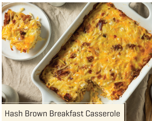
Hash Brown Breakfast Casserole