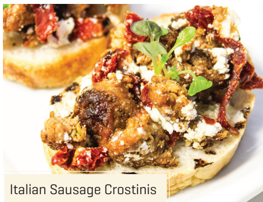
Italian Sausage Crostinis