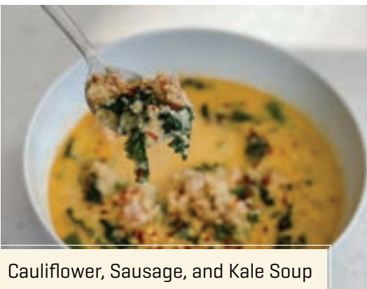
Cauliflower, Sausage, and Kale Soup