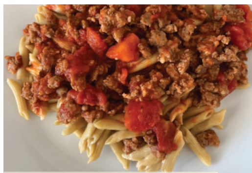
One Skillet Italian Sausage Pasta