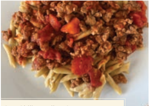
One Skillet Italian Sausage Pasta