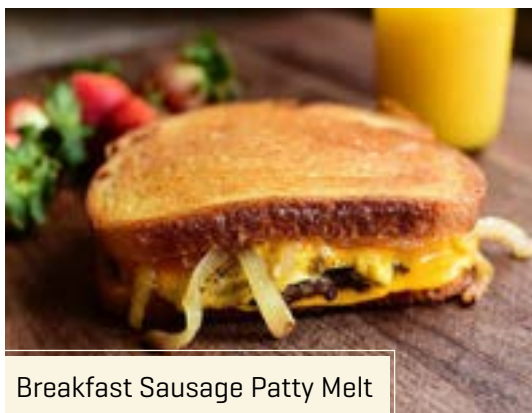
Breakfast Sausage Patty Melt