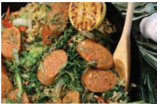
Italian Sausage with CauliRice & Spinach