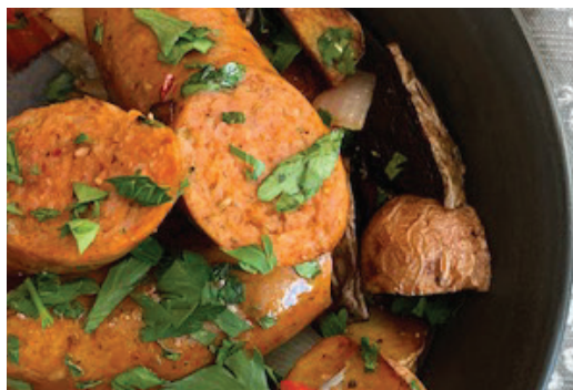
Italian Sausage with Peppers & Potatoes