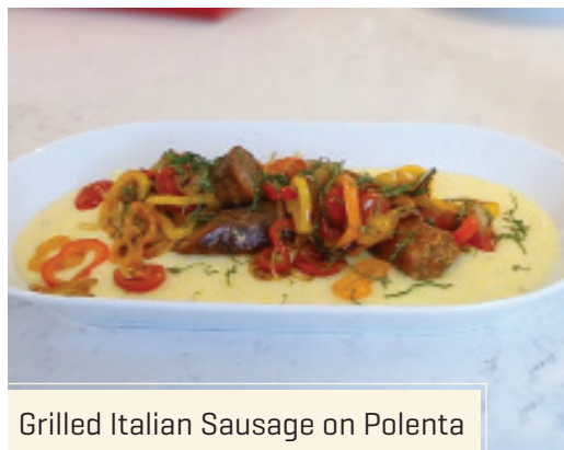
Grilled Italian Sausage on Polenta