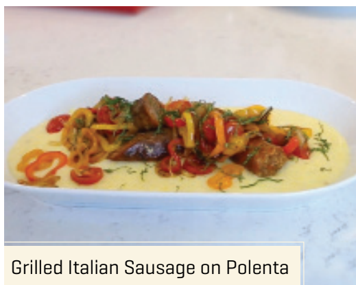
Grilled Italian Sausage on Polenta