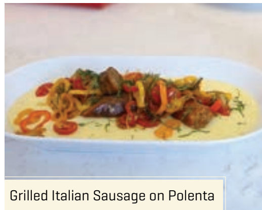
Grilled Italian Sausage on Polenta